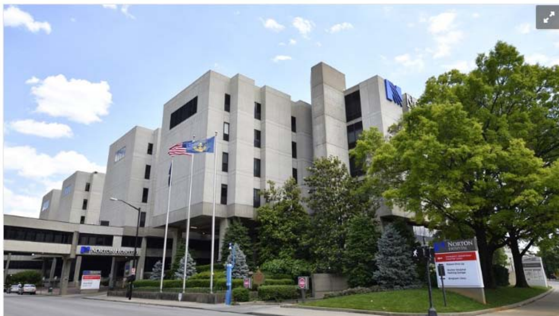
Norton Hospital tied for No. 3 best hospital in the state, according to U.S. News & World Report's ranking of the nation's best hospitals.